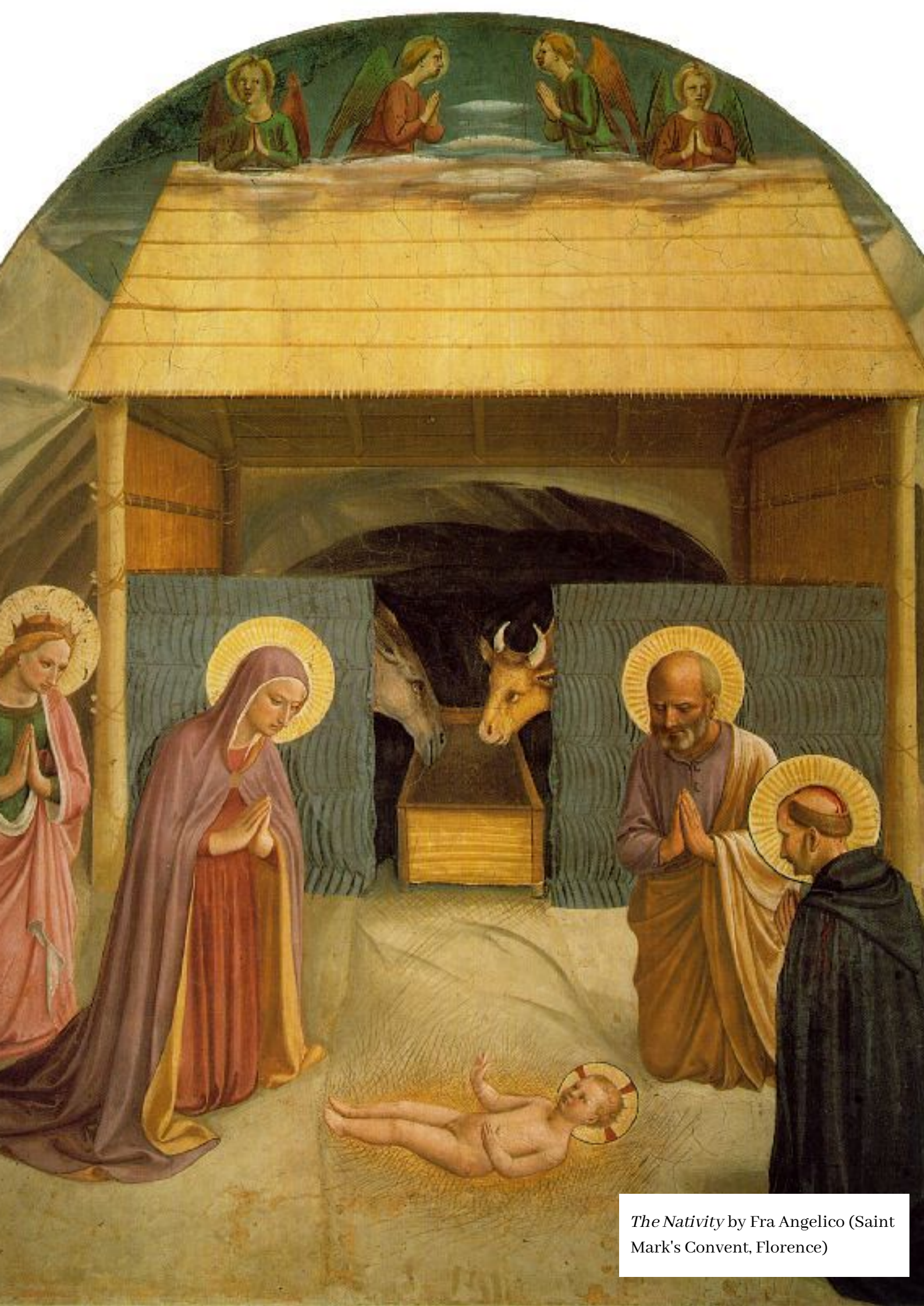
The Nativity by Fra Angelico (Saint Mark's Convent, Florence)