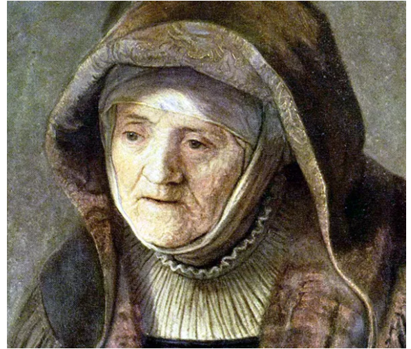
"Prophetess Anna" by Rembrandt, 1639

Sometimes, good news takes forever to arrive. This year, how many of us have tuned into the news each evening or refreshed our social media with the hope of finding some encouragement? In today's Gospel, we meet someone who waited at least fifty years for the good news she was expecting. But her waiting time was not wasted time, because she spent it in prayer and hope.