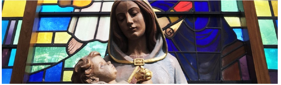
Statue of the Madonna in the Parish of Mary, Mother of God, Bradford

Mary pondered the shepherds' news that Jesus is our Saviour, who brings "peace to people of goodwill". On the threshold of a new year we too ponder what Christ's peace might look like in our lives. True peace which Christ brings is not just an absence of conflict but comes from a desire to serve in love. May our Lady shows us this peace in 2021.