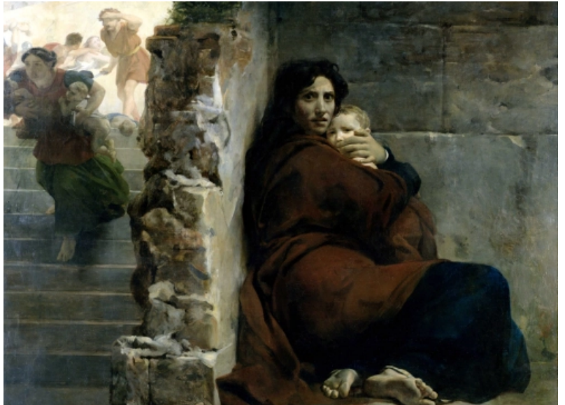
'Scène du massacre des Innocents' by Léon Cogniet, 1824

Today the Church sits in mourning in the midst of celebration. Yes, Jesus our Emmanuel has been born and His presence breaks into the darkness. But all is not well in the world. The Holy Family's flight into Egypt and Herod's massacre of children reminds us of the tragic reality of suffering caused by cruelty and injustice.