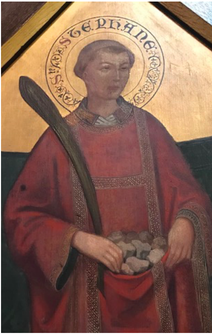
Painting of St Stephen in St Stephen's Church, Skipton

Today we celebrate the feast of St Stephen, the first martyr of the Church. The term "Boxing Day" comes from the Middle Ages, when boxes of alms were distributed to the poor. The connection between our saint and this tradition is that Stephen was one of the seven deacons responsible for distributing food to widows in the early Christian community (Acts 6). St Stephen showed his generosity through charity, as well as by witnessing to the truth of Christ's divinity.