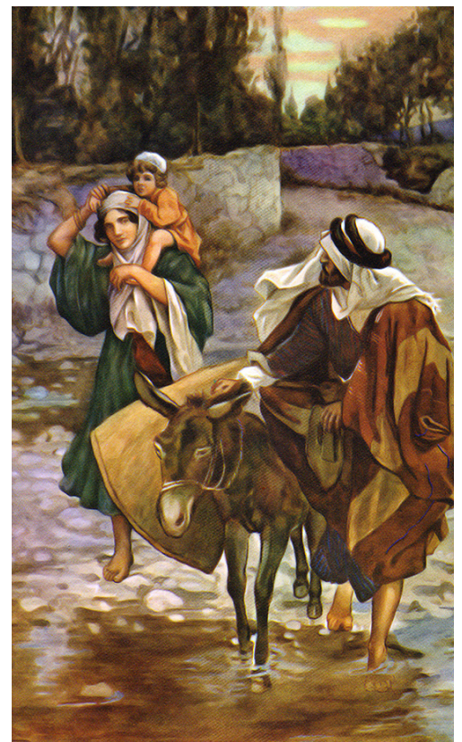
"Flight into Egypt" by William Hole, 1894

Put simply, intercessory prayer is praying for others. When we intercede we take the place of another person, or "plead their cause". Christ is our model for intercessory prayer. During His earthly life Jesus prayed for others - for the sick, for his disciples, and for future believers. In heaven, Christ is our mediator before God the Father, which is why we address our prayers to God, through Jesus Christ, and in the Holy Spirit.