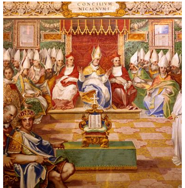
Fresco of the Council of Nicaea from the Sistine Chapel, Vatican (1590)